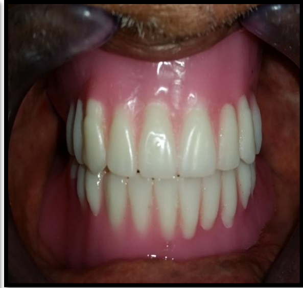
Figure8: Denture insertion