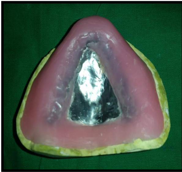
Figure5: Metal denture base