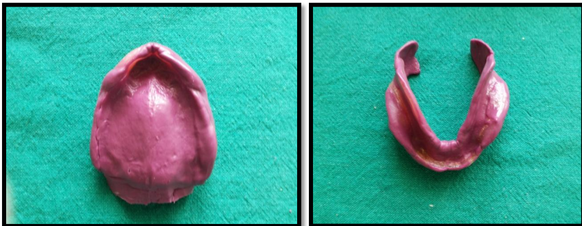
Figure 2: Primary impression made with elastomeric impression material