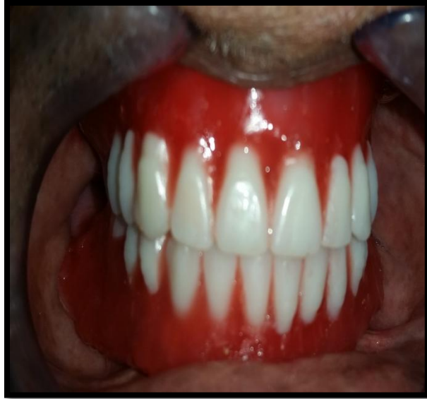
Figure7: Try in done