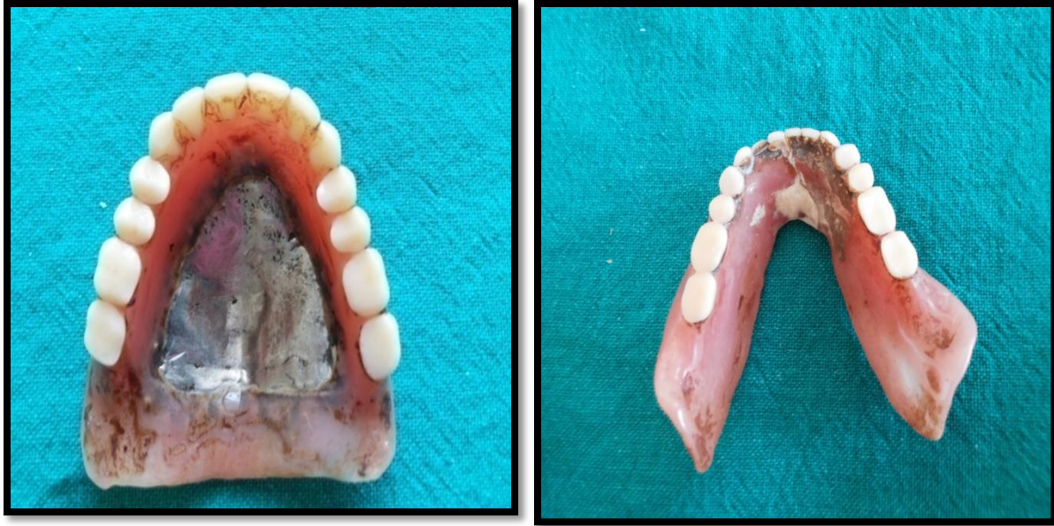
Figure 1: Attrited teeth in upper denture and midline fracture of lower denture extending from interdental region of central incisor to flange area.

Teeth arrangement was done in a conventional manner in class I molar relation. Try in was done (fig 7) and acrylization of denture done with heat cure acrylic resin. Denture insertion was carried out.(fig 8) Post insertion instructions were given regarding denture maintenance and oral hygiene.