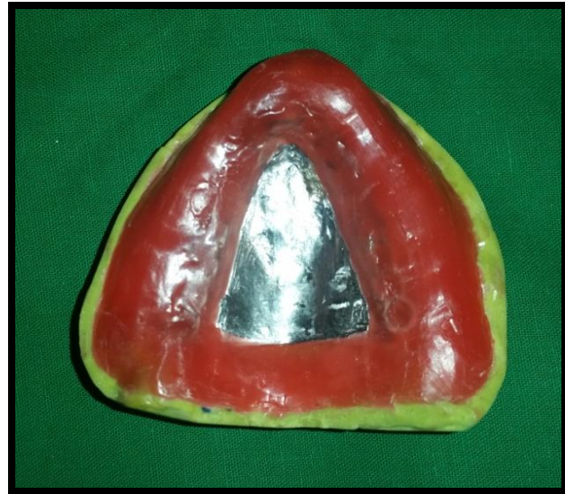
Figure4: Metal base and wax for smooth denture base